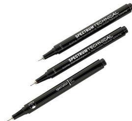
DP407C Spectrum Technical Pen Set