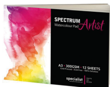
PB051... Spectrum Artist Watercolour Paper Pads