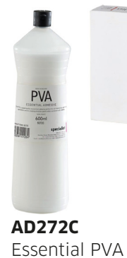
AD272C Essential PVA