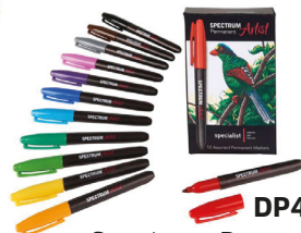
DP429B Spectrum Permanent Colour Markers