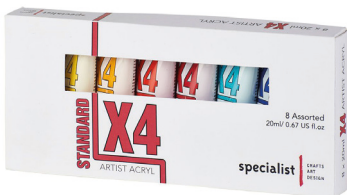
PD367A X4 20ml Assorted Sr