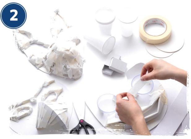
Use scrunched up tissue paper or newsprint, pieces of folded card, plastic drinking cups, polystyrene balls, or any other lightweight objects to build up the 3D shape for your mask. Use strips of masking tape to hold everything securely in place.