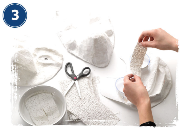
Cut strips of Mod Roc, enough for 2 or 3 layers. Dunk each strip of Mod Roc into a bowl of cool, clean water and gently run your fingers down each strip to remove excess water.