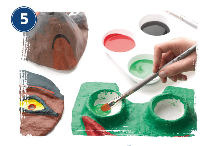
Paint your mask using X2 Free flow Acryl acrylic paint, stippling with the brush to cover any textured areas of the surface completely. Allow to dry thoroughly.