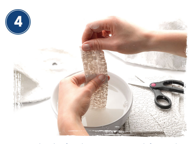
Lay each strip of Mod Roc onto your mask form and use your fingertips to gently smooth each piece, ensuring that the plaster is smoothed over the surface before adding the next strip. Once you have built up enough layers to make your mask strong, allow to dry completely.