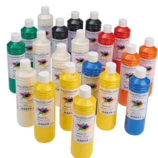
PD384B Readymixed Intro Pack of 20