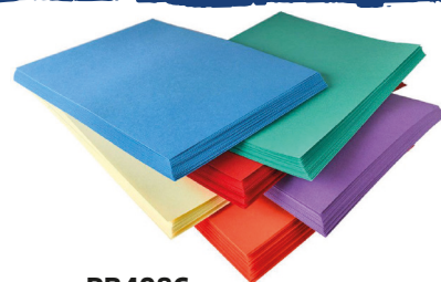
PB408C Brite Card 200 Microns