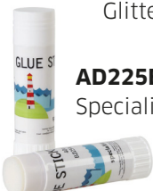
AD225E Specialist Crafts Glue Sticks