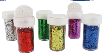
CR025 Glitter Tubes Assortment