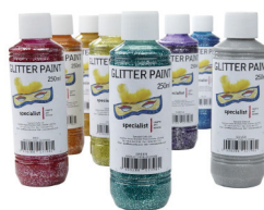
PD197D Glitter Paint Assortment