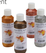
PD385B Liquid Metal Paint Set