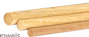
MT767A Round Wooden Dowels