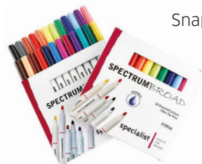
DP399C Broad Markers