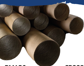
PM156 Card Tubes