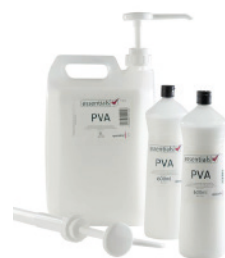
AD272... Essential PVA Glue