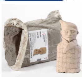
PM570... Air Drying Clay Stone