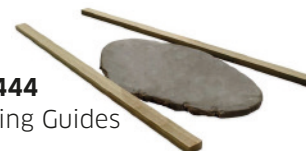
PM444 Rolling Guides