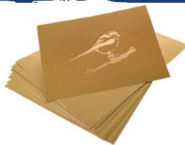
PB155... Stencil Card Sheets