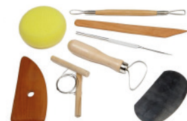
PM087 Economy Pottery Tool Kit