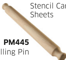
PM445 Rolling Pin