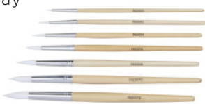
BR920A... Student Round Synthetic Short Handled Brushes