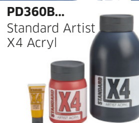
PD360B... Standard Artist X4 Acryl